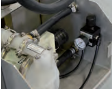
Pressure regulator and double membrane pump