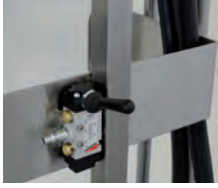
Air connection and lever