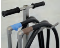
Suction and return pipes