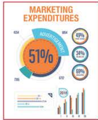
Full color sheets, envelopes and cards