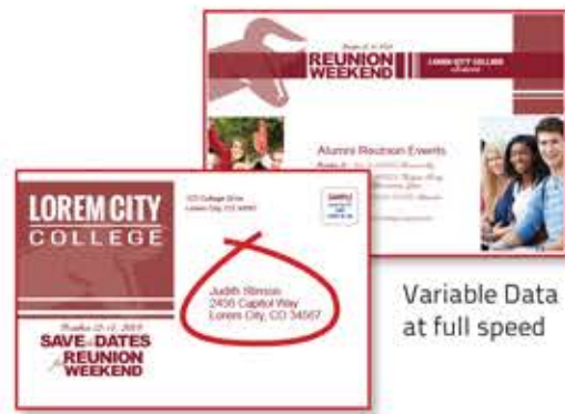
Variable Data at full speed