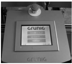
Desk, front plate