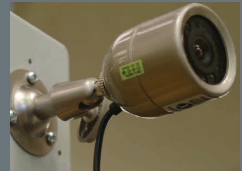
CCTV Stack Monitoring System