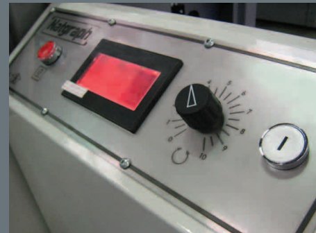
Touch Screen stacker control