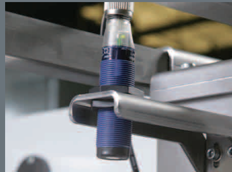
Sheet jam sensing system