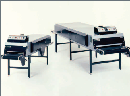
Different sizes available