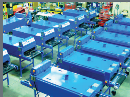
Large order final assembly