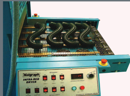
Adjustable to accept 3D objects