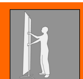
Secure the tension of the graphic