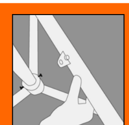
Attach the graphic on the bottom pin