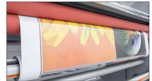
Rear rewinding shaft for printed media in rolls