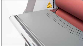
Vacuum feed in table for thin papers (optional)