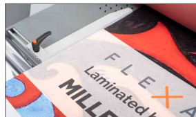
Reference square with guide for hard materials