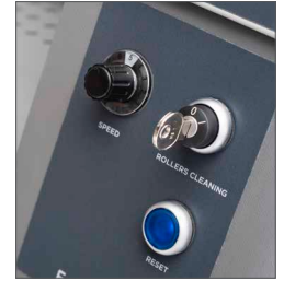
Electronic working speed adjustment by potentiometer