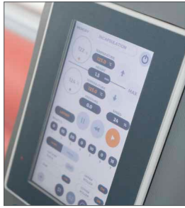
Control keyboard for all the working functions