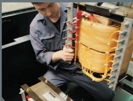
In-house UV transformer fitting

There is a replaceable pre-filter that removes any airborne particles within the unit. If this filter is regularly replaced, then the charcoal filters within the unit will never need to be changed. These units are designed to function without reducing the efficiency of the UV Dryer.