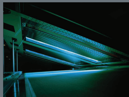
Glowing UV lamps