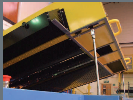
Gas filled lifting arms on the hood