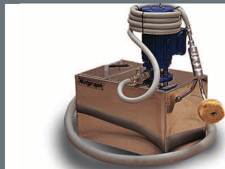
ATEX Approved recirculation unit