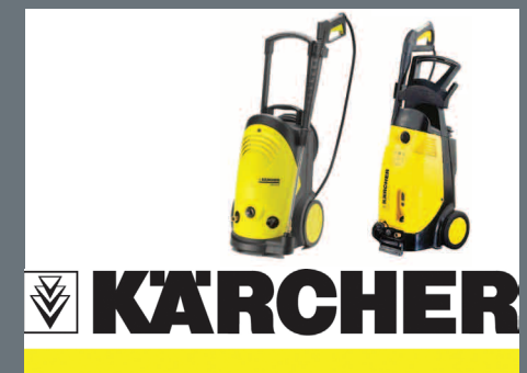
KARCHER High pressure washers