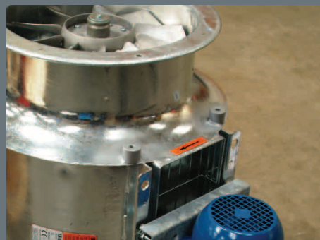
ATEX Approved extraction fan