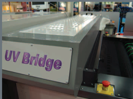
UV Bridge positioned on inlet