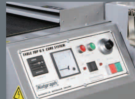
TTUV - ammeter / hour meter