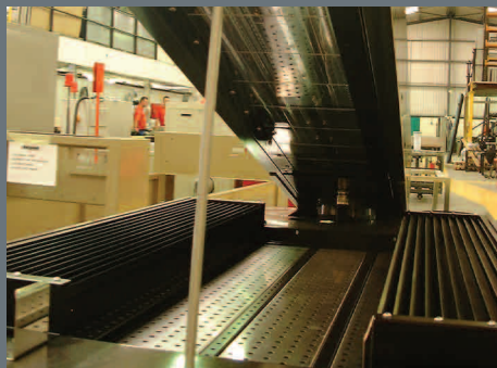
Compact 1 metre bridging module